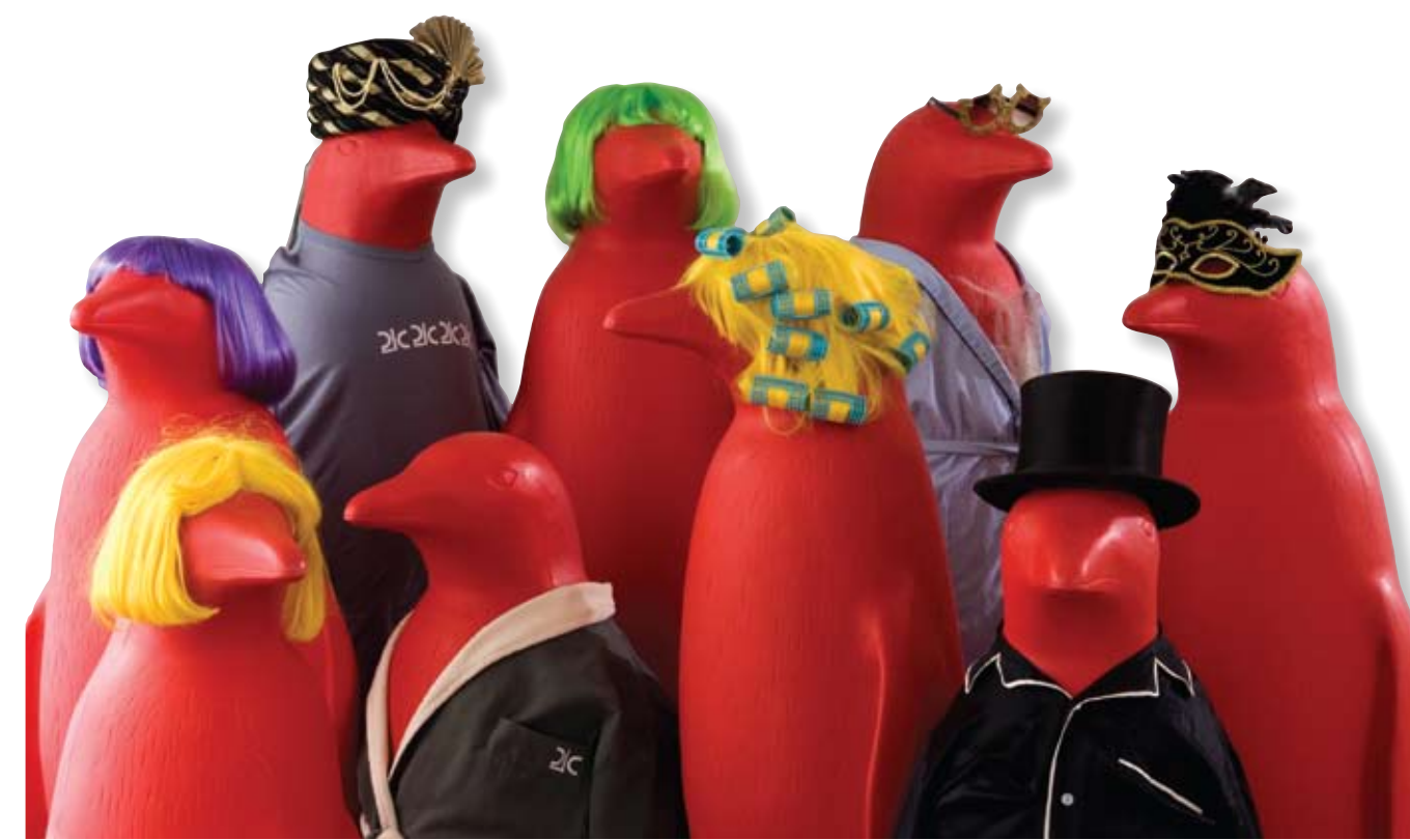
Red Feathers, Pajamas, or Black Tie