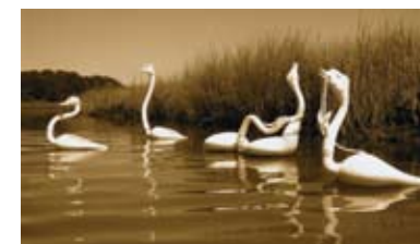
The Evolution of Desire , 2007 Archival digital print mounted on plexiglass, Edition #3/10 50" X 24.5"