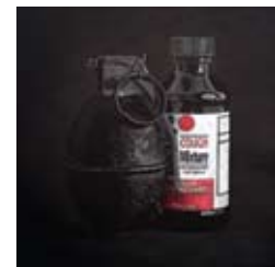
Grenade with Cough Syrup 2008 Acrylic on paper 30 x 30 inches