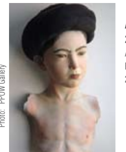
Ayatollah Fragment 2005 Aqua-resin and casein Edition #1/6 20 x 7 x 5 inches

Judy Fox has four life-size figurative sculptures permanently installed in the reception gallery at 21c Museum. A pioneer of contemporary figurative sculpture, Fox's figures are cast in terra-cotta and meticulously painted. Her sculptures often fall between the past and present while exploring the real and the imagined. Fox will be donating a study of the full size sculpture from 21c entitled, Ayatollah . www.judyfox.net $12,000.21