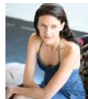
ELENA DORFMAN table

Only six unique patron tables are being offered. Each table of 10 guests will be hosted by an artist represented in the 21c collection and will come with a unique or commissioned work by the artist.