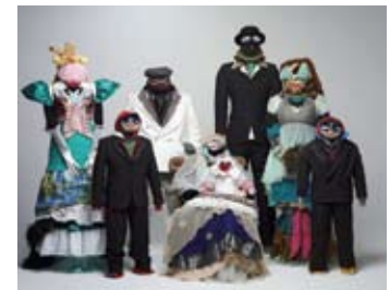
The Family , 2005 Reclaimed garments and mixed media