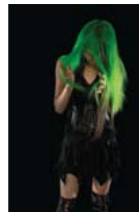
Scarred Sorrow 2005 C-print