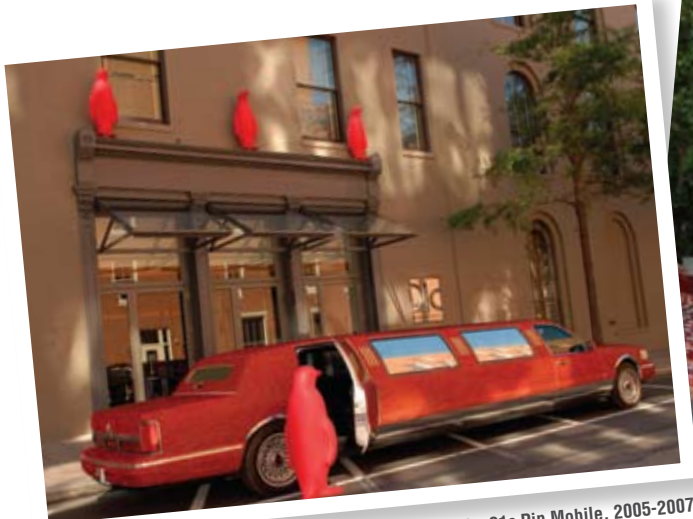
"Arillated": The 21c Pip Mobile, 2005-2007 Glass gems, silicone and 1995 Lincoln Towne Car stretch limousine

And a "Bedtime Story" by a special mystery guest